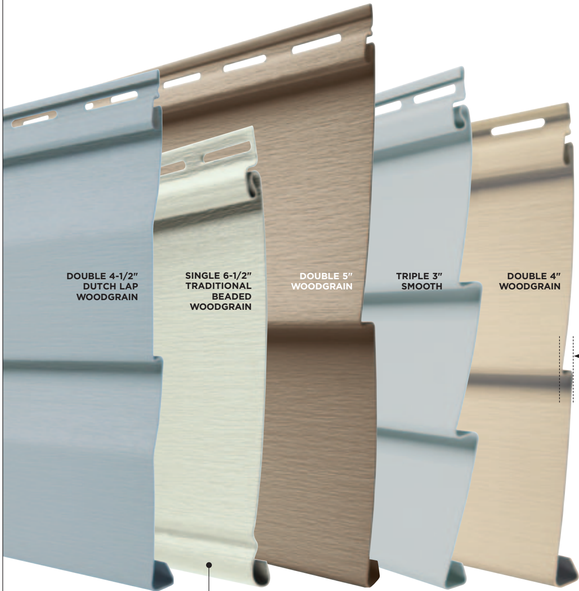
DOUBLE 4-1/2" DUTCH LAP WOODGRAIN